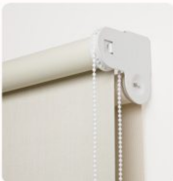
Holder for Twin Blinds